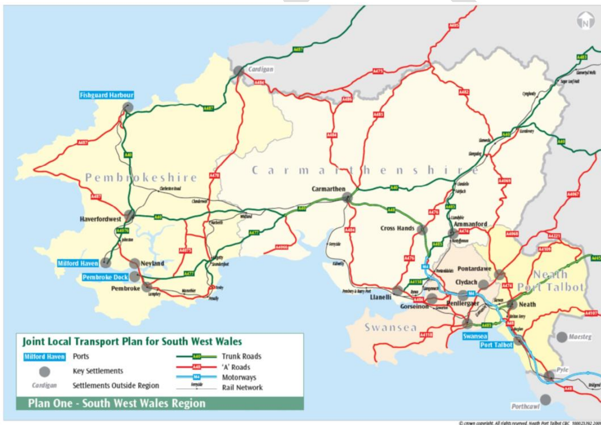
Figure 1 – Area Considered in the South West Wales Regional Transport Plan.